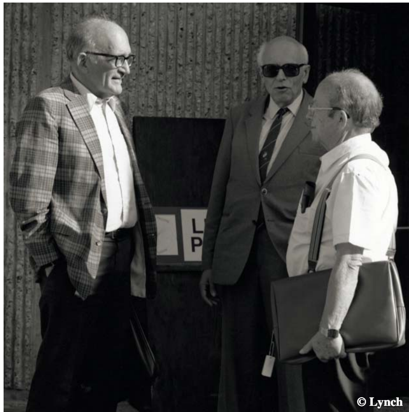
(Sidney Drell, Andrei Sakharov and Wolfgang Panofsky)

Panofsky: I know. I met Sakharov probably three or four times during these parts of these bilateral discussions sponsored under the auspices of the control group chartered by our National Academy of Sciences, of which I was a member (the chairman actually) - I'm interested in this reference. I mean, I'm not very learned in a historical sense.