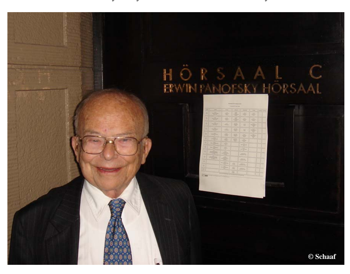
"I am a Klempner!"

interest. He very rarely came to the seminars in Berkelev.